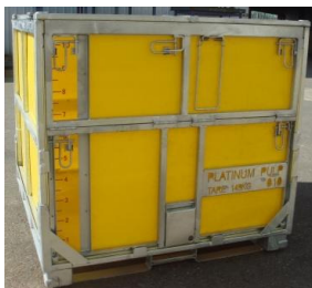
Liquid Multibox showing full length sight glass

The Multi-Box is tested to International Safe Transit Association (ISTA) Standards and is manufactured in an ISO9001 accredited facility by a major world leader in the manufacture of intermediate bulk containers and cubic containers. It all adds up to excellent value at a very competitive price.