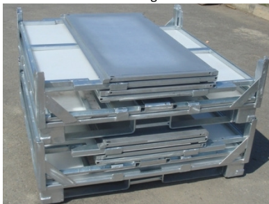
Lids are attached to the sides – means no loose pieces.